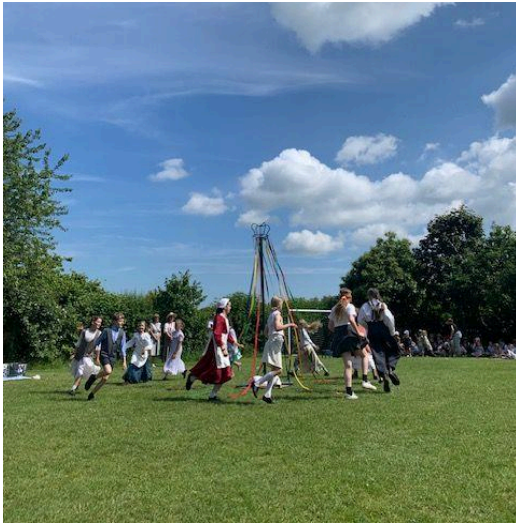
The new maypole purchased by the PTFA